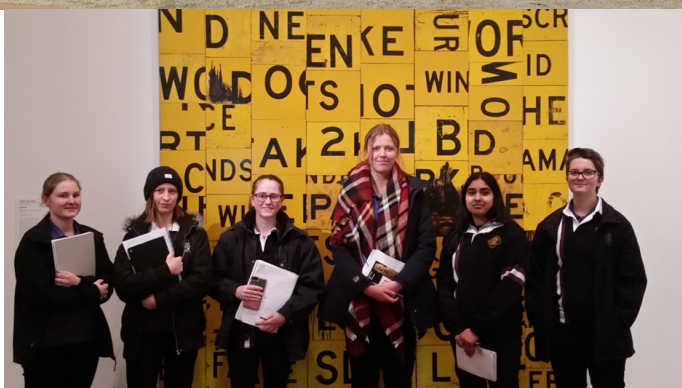
"Flash art" 1987 by Rosalie Gascoigne at NGV